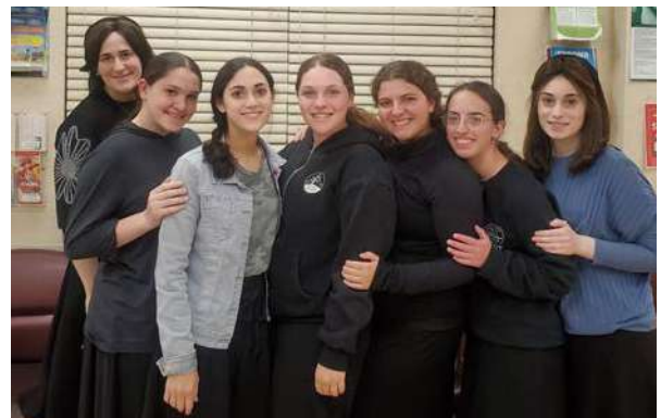
Newly certified American Red Cross Water Safety Instructors