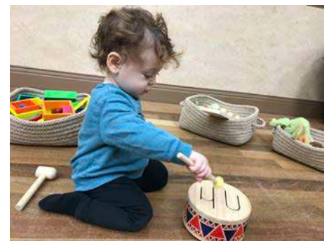
Through play, children learn about the world and themselves.