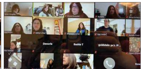
Ed Directors Virtual Meeting