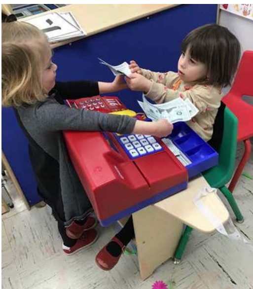
Children at YvY's Staten Island Forest Hill Road Center, exchange bills. Cash register pretend play brings money math to life!