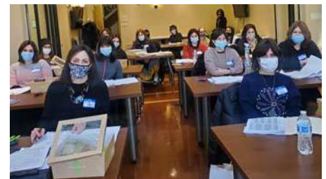
Masks can't hide the smiles from YvY's devoted PC members!

The YvY Policy Council continued its active role in the decision-making process of the HS/EHS program. Meetings were held in central office several times throughout the year with members being updated on all aspects of the program. Monthly reports are shared with the PC and training is ongoing to assist the members in making informed decisions in the direction of the HS program. The combined force of the Board of Directors and the Policy Council, along with management staff, are a powerful force that provides leadership and strategic direction for the organization. YvY wishes to thank the Policy Council and Board members which have helped YvY run smoothly this past year.