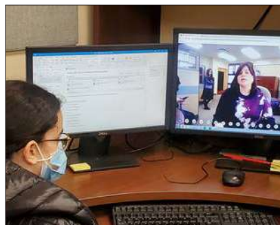
Family Workers Tuesday Talks