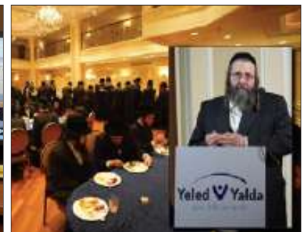
Comprehension Skills Training