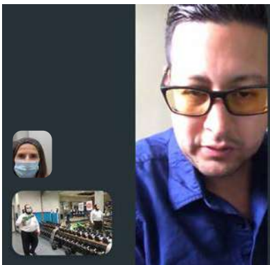
Virtual DOH inspection of the gym

The Yeled VYalda Fitness Center reopened in gradual stages this past year, as allowed by the NYC DOH guidelines; first the gym room, followed by the pool and finally the steam room and sauna. Classes have started up again and, as time goes on, additional classes will be added to the schedule. The demand for swim instruction always goes up in the spring and summer, and fortunately the Fitness Center was able to certify seven new WSIs just in time. Members are happy to be back resuming their fitness routines among old and new friends. The Fitness Center restarted the free membership plan for Head Start/ Early HS parents, and although the plan is suspended in the summer, it will restart in the fall. Parents should inquire at their child's school for more information. The Fitness Center can be reached at 718-686-3788 or by emailing fitness@yeled.org.