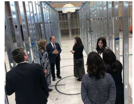
Head Start Leadership Team visits Lakewood Expansion Partner Sites