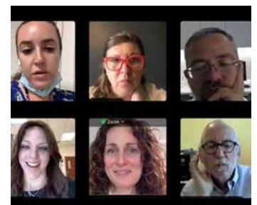
HAC members and guests collaborate virtually

As the year comes to a close, the Nurses at Yeled have been very busy preparing the sites for the upcoming school year by training all staff members in important health and safety classes such as Infection Control and Emergency Preparedness among others. As rules and regulations regarding Covid restrictions continue to change, we aim to be in as much communication as needed with all staff and families so that when we meet again next year, we will maintain compliance and have a safe experience for the children and staff. Wishing you a Happy and Healthy Summer!